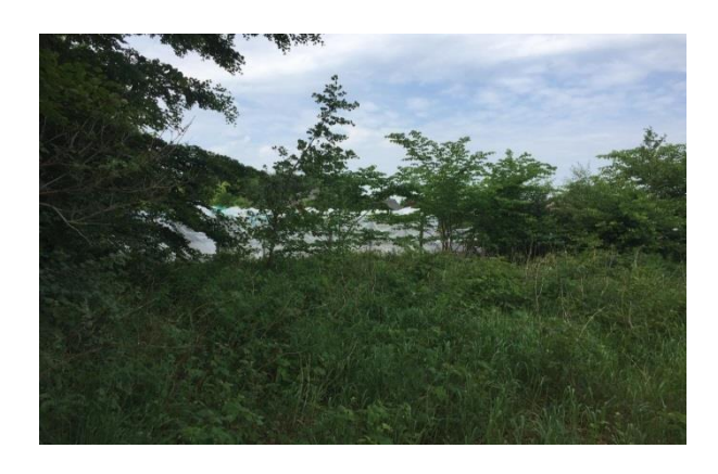
Location 2 - Letbæk Plast rainwater basin:

Location 1 - Letbæk Plast production, inaccessible: