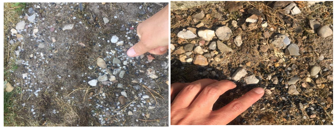
Location 9. HN Group, Kløvermarken 310, Billund, OCS certified: