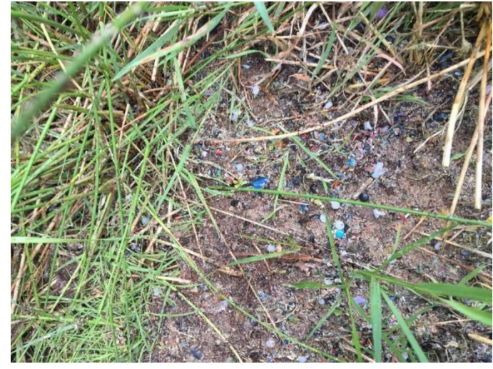
Location 8. Three pictures of the banks of the water reservoir